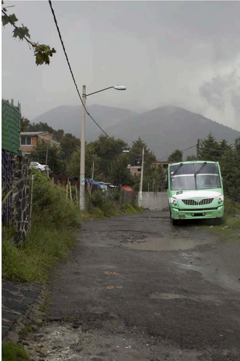
Ahuayoto during a heavy rainstorm. The peak on the left is Ajusco Peak, the highest point in the city's territory at over 12,000 feet.