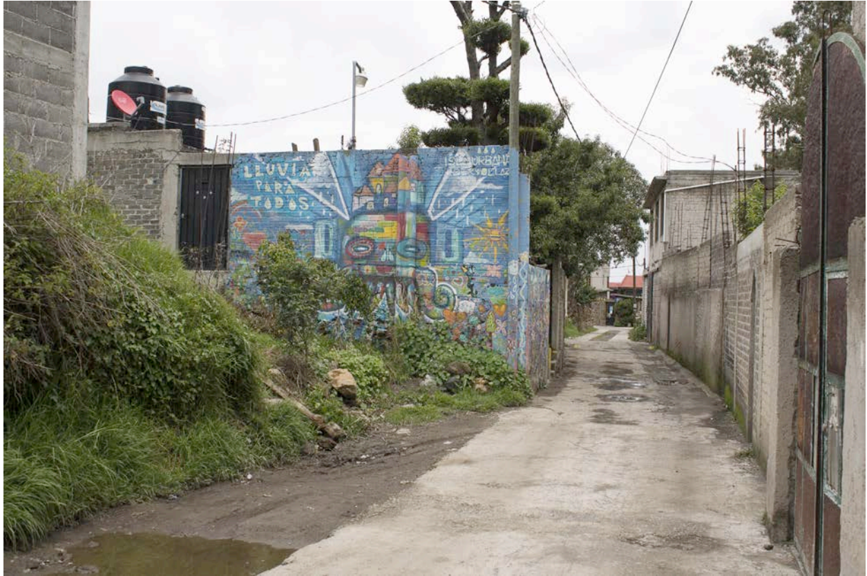
A mural painted by Isla Urbana in Huacahuasco as part of the Carpa Azul program.

years ago and moved the family there from the center of Mexico City. Initially, they carried water from a distant well one hour away using a cart or donkey. For the past 8 years or so, they have purchased water from private vendors who cruise the neighborhood in pickup trucks. She said that pipas from the delegación generally do not service Huacahuasco, but they do provide water to another nearby colonia . 353 Huacahuasco's consolidated core appears on Xochimilco's 2005 urban plan as a "rural and agricultural production area" with "very low-density rural habitation." 354 The plan explains this classification to mean a "rural area where their predominant activity is impacted by the use of housing" that will be subject to a "specific study" and other