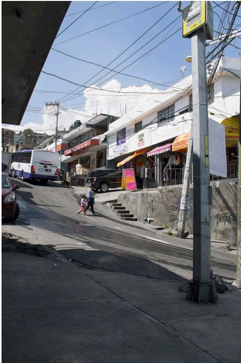
Avenida Bosques, the street that forms the border between Bosques del Pedregal and San Nicolás II, as well as the urban and conservation zones. Photo by the author, 2018.

San Nicolás II's land tenure status is a bit complex. Its border with Bosques del Pedregal—a main thoroughfare known as Avenida Bosques—also marks the limit of the urban area. This means that San Nicolás II falls within the conservation zone. 264 However, the neighborhood is now densely urbanized, and its removal seems improbable. It has paved streets,