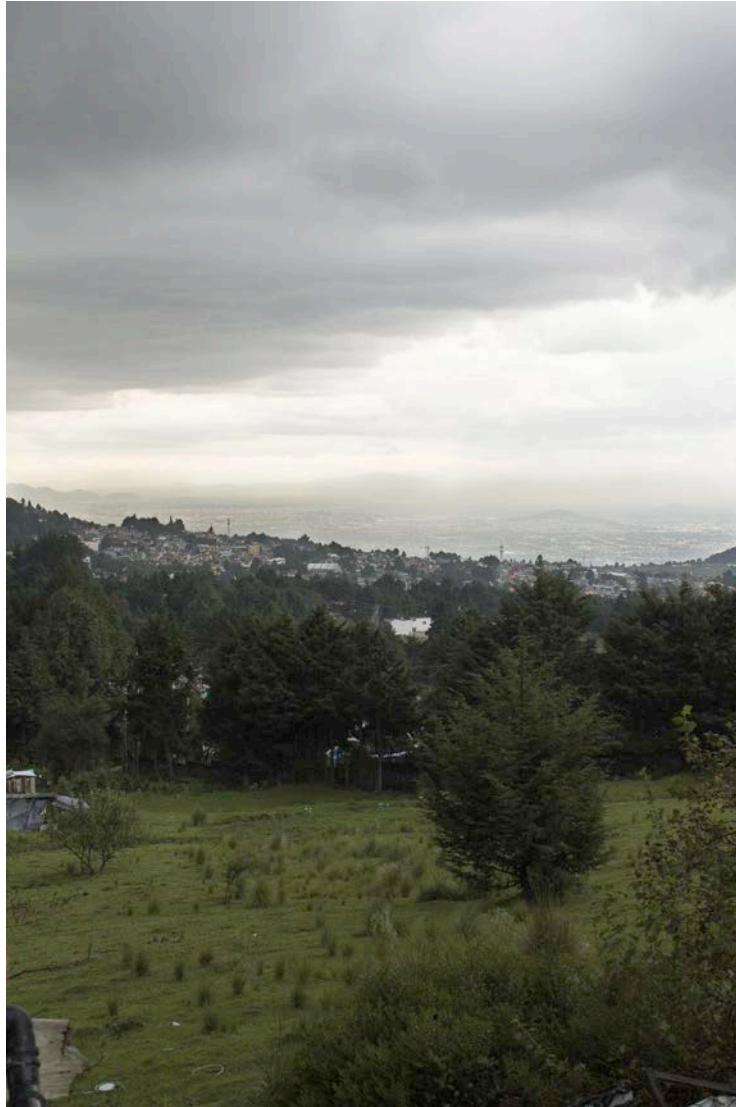
A passing rainstorm, Ahuayoto.

Rainwater harvesting is simply a way for residents to meet these lagging needs. “It’s just a way for individual houses to have more water,” Enrique clarified. “[It’s] a way of reducing demand from outside sources.” 436