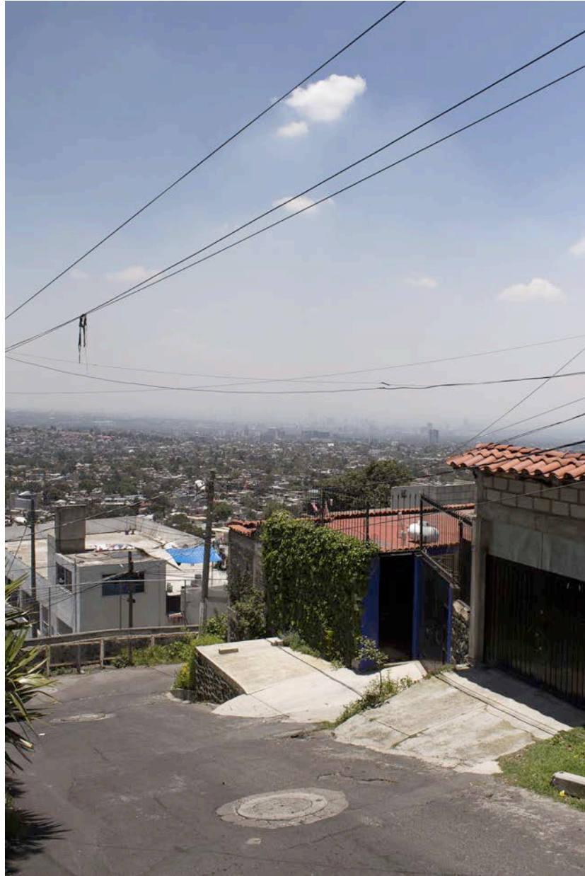
The view of the valley from Bosques del Pedregal.

benignity,” Alzate declared, “to have granted Mexico not only the necessary water, but even leftovers with much excess.” 58