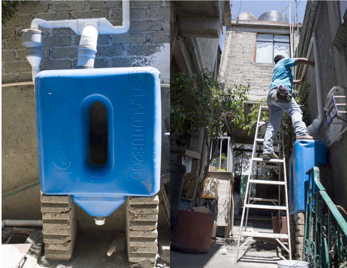
One of Isla Urbana's tlaloques (left). An Isla Urbana team member installs a rainwater harvesting system (right).

runs back out of the cistern to an electric pump. When turned on, the pump will remove water from the cistern, and pass it through two more filters—one to remove microscopic sediments and another carbon filter to purify color and taste. Once through the filters, the water will continue through another series of pipes that return it to Jorge's roof, where it will be stored in a large tank, known as a tinaco . The water is unlikely to be potable, but when Jorge wants to do laundry, wash dishes, or bathe, the liquid that fell from the sky will trickle down from the tinaco , ready for his immediate usage.