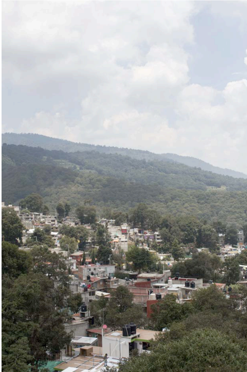
Bosques del Pedregal and the Ajusco Range.

but incredibly steep. Walking downhill, he can survey the vast urban expanse of the Valley of Mexico until it disappears into the haze of the capital's infamous smog. Walking uphill, he can see where the city ends and the high alpine forests of the Ajusco Range begin. The Picacho-