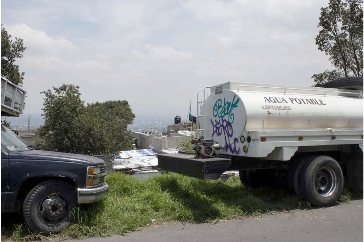
A pipa truck.

most of the daily deluge is shuttled out of the city through its drainage system in order to prevent flooding. 42